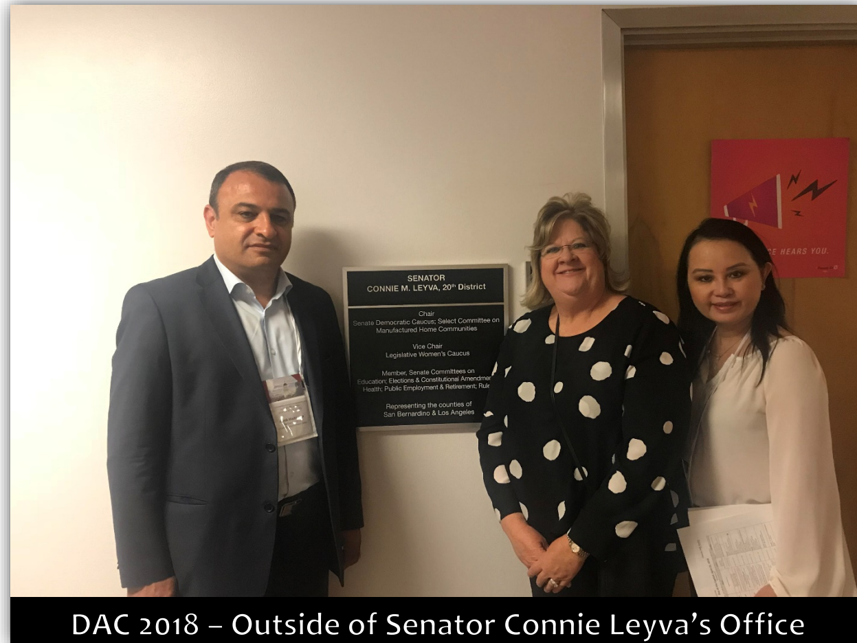
DAC 2018 – Outside of Senator Connie Leyva's Office