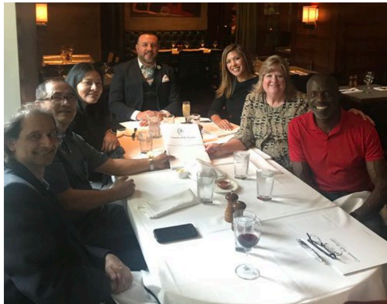
DAC 2019 – Membership Dinner