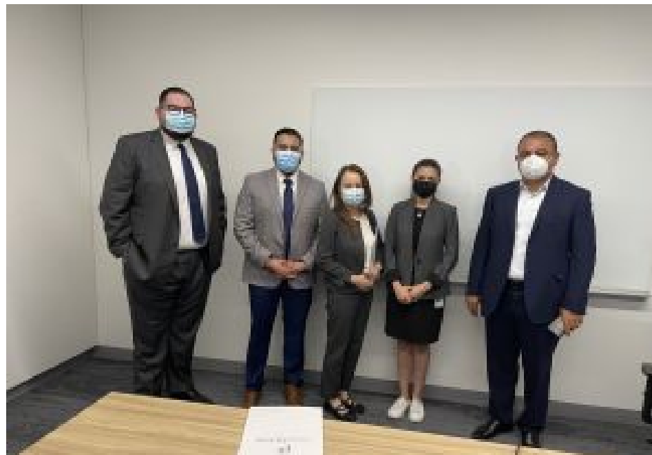
CHSI & Unicare with Asm Reyes' staff