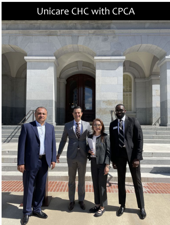
Unicare CHC with CPCA