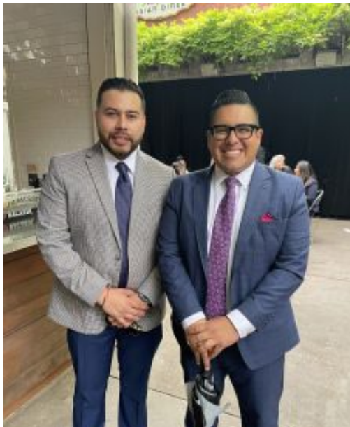
CHSI with Asm Cervantes' Staff