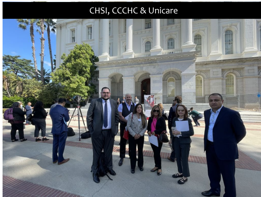
CHSI, CCCHC & Unicare