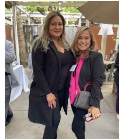
CHAIR & CCCHC